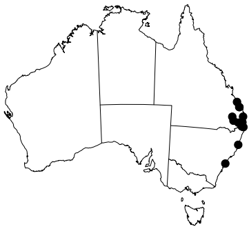
Map 3: Hyperphyscia pandani