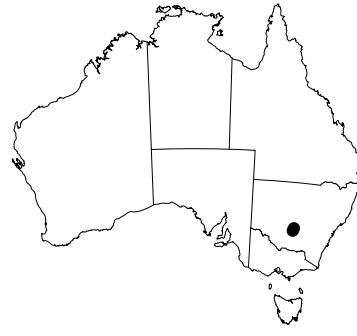
Map 2: Hyperphyscia isidiata