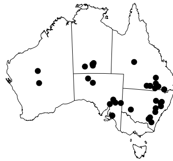
Map 4: Hyperphyscia pruinosa